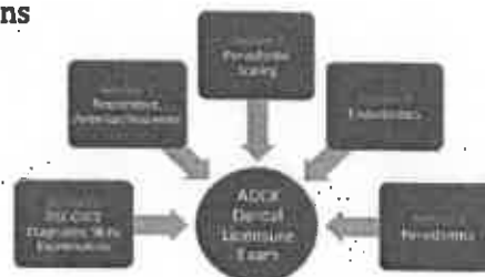
Diagram of ADEX Dental Licensure components. Full size rendering attached for your use, unmodified.